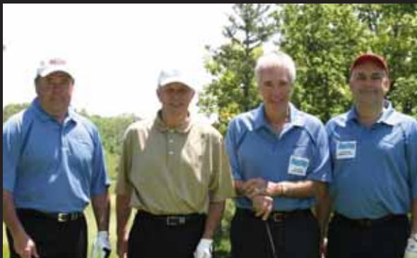
Pro Am Golf Classic Teams