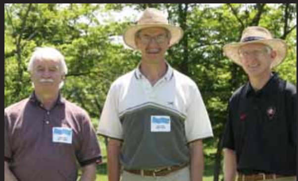
THANKS TO OUR LONG SUPPORTING TEAMS