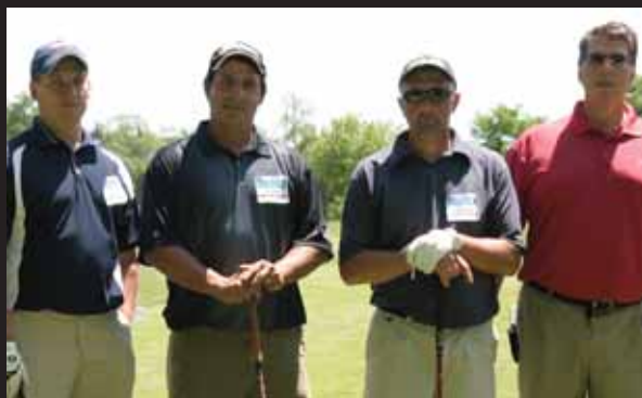
Pro Am Golf Classic Teams