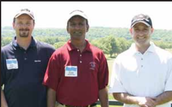
Pro Am Golf Classic Teams

Thanks for making this such a great day!