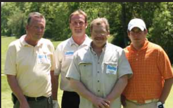
Pro Am Golf Classic Teams

We thank you for your ongoing support, we couldn't do it without you!