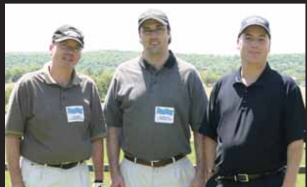
THANKS TO OUR LONG SUPPORTING COMPANIES