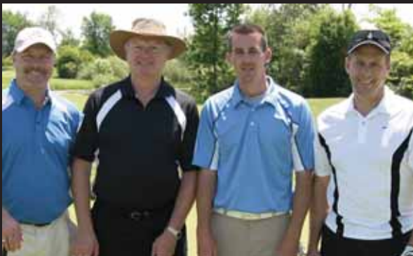
Pro Am Golf Classic Teams