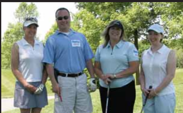
Pro Am Golf Classic Teams