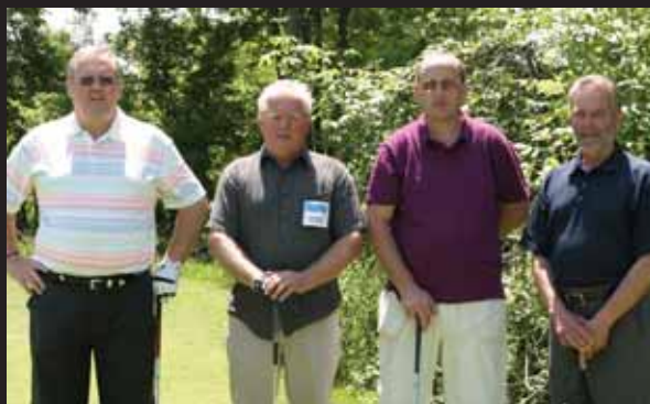
Pro Am Golf Classic Teams