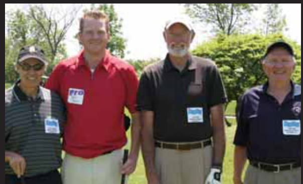
THANKS TO OUR LONG SUPPORTING TEAMS