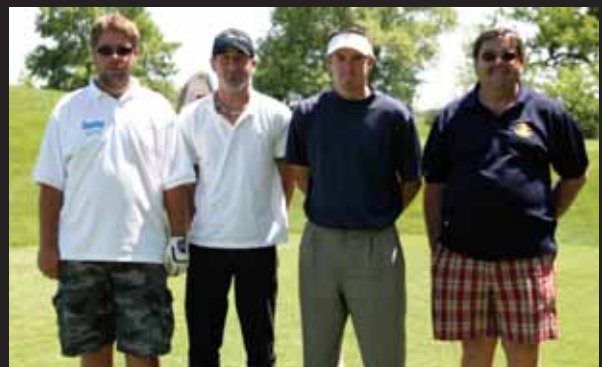
THANKS TO OUR LONG SUPPORTING COMPANIES