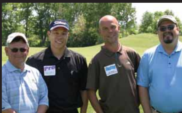
Pro Am Golf Classic Teams