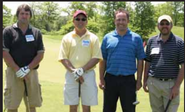
THANKS TO OUR LONG SUPPORTING FRIENDS