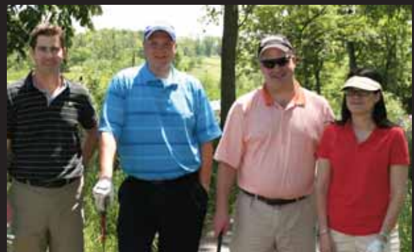
THANKS TO OUR LONG SUPPORTING TEAMS