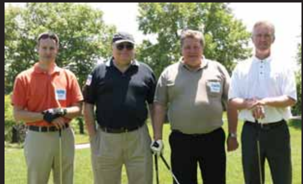
THANKS TO OUR LONG SUPPORTING FRIENDS