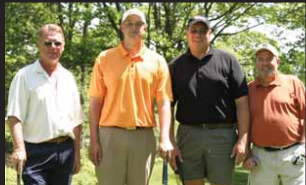
THANKS TO OUR LONG SUPPORTING TEAMS