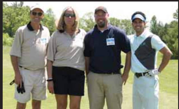
THANKS TO OUR LONG SUPPORTING FRIENDS