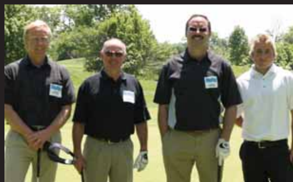
THANKS TO OUR LONG SUPPORTING COMPANIES