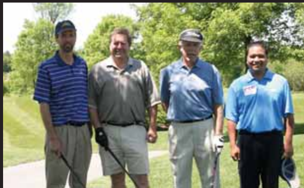
Pro Am Golf Classic Teams