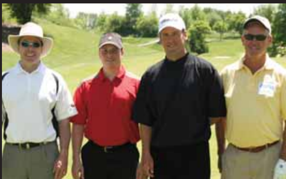
Pro Am Golf Classic Teams