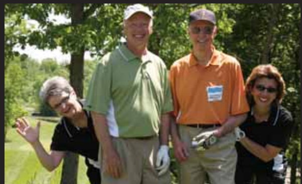
THANKS TO OUR LONG SUPPORTING TEAMS