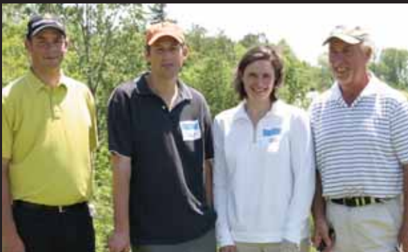
Pro Am Golf Classic Teams

Hauser Lafarge Paving & Construction Mister Transmission Rockton Berry Farm Creative Portraiture Revera Inc. Shred-Tech The Pine Group