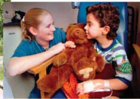
2007 Shot of the Day!