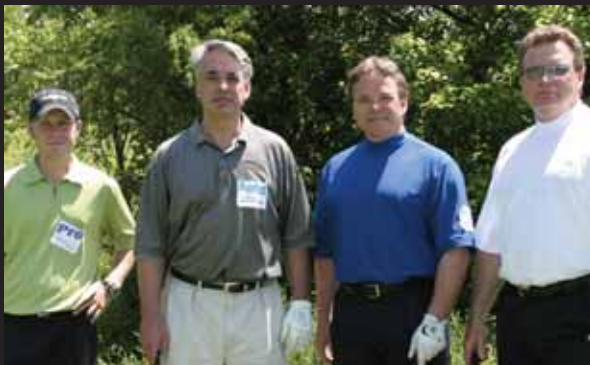
Pro Am Golf Classic Teams