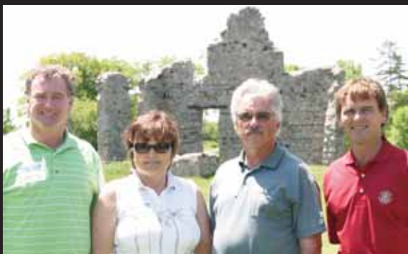
Pro Am Golf Classic Teams