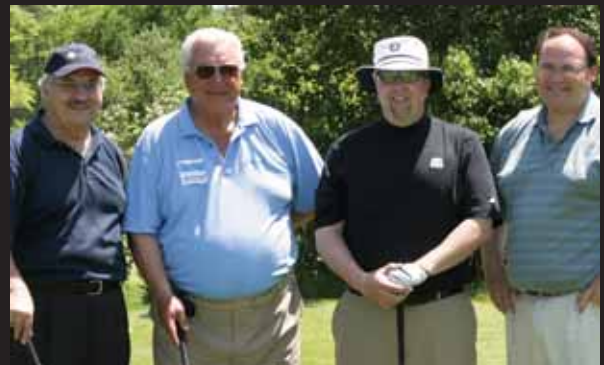
THANKS TO OUR LONG SUPPORTING FRIENDS