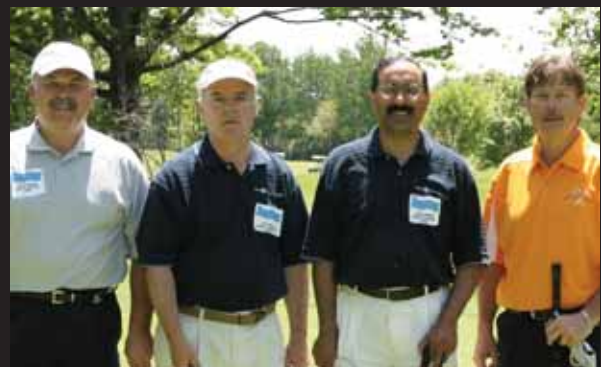
THANKS TO OUR LONG SUPPORTING COMPANIES