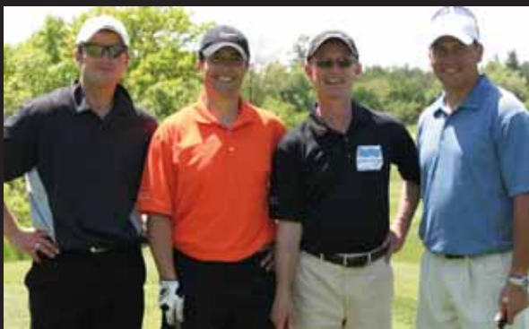
Pro Am Golf Classic Teams