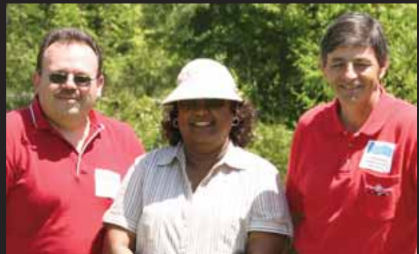
THANKS TO OUR LONG SUPPORTING COMPANIES